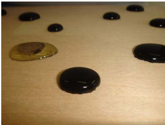
Oil and fatty contaminations on an impregnated wood surface